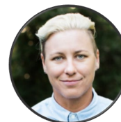
ABBY WAMBACH FIFA World Cup Champion, Author, Co-founder of Wolfpack Endeavor

Past Keynote Speakers include: Michelle Obama, Brené Brown, Arianna Huffington, Suze Orman and more!