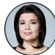
ANA NAVARRO Political Contributor & Co-Host of ABC's The View