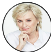
TINA BROWN Author, Journalist, Magazine Editor