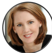
GRETCHEN RUBIN Author, The Happiness Project