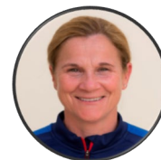
JILL ELLIS Legendary Head Coach of the United States Women's National Soccer Team